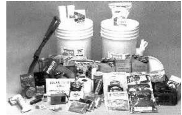
Some kits are available for purchase in stores.