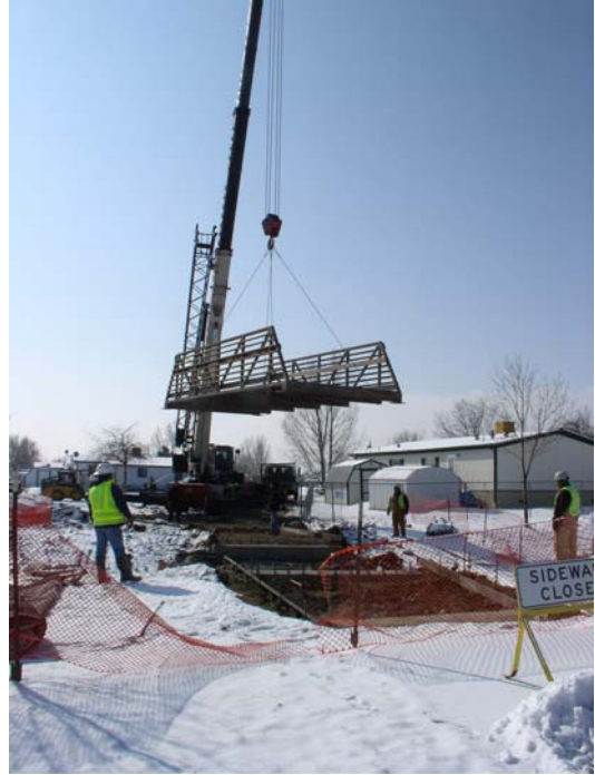
The Brandywine Park pedestrian bridge near Cimarron Mobile Home Community was lifted into place on Wednesday, Feb. 14.

Work on the shelter continues. The masonry work has begun and the building is beginning to take shape. The masons could not work two days the week of February 12 due to cold temperatures but are working again. The exterior walls should be completed this week so that work on the interior and slab can begin. Construction is still expected to be completed by spring 2007.