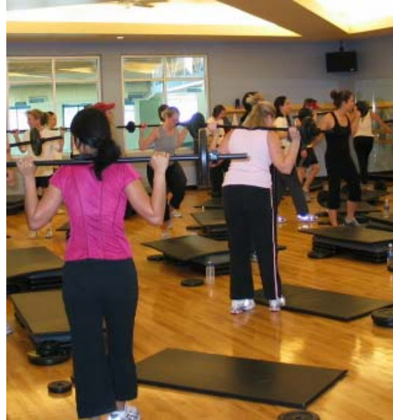
BodyPump® classes have been wildly popular at the Paul Derda Recreation Center.

*Numbers are down because of the snow. Many of the seniors did not come to class regularly and three classes had to be cancelled because of low participation.