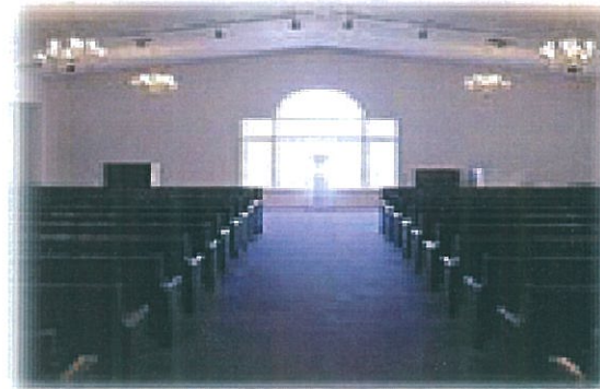
Our Chapel is available for families who desire a memorial service.