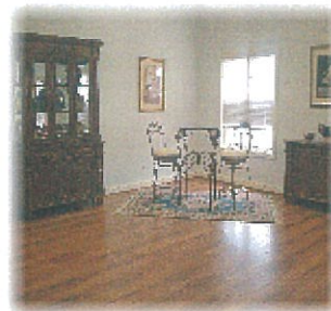
Our Community Room is available for family gatherings.